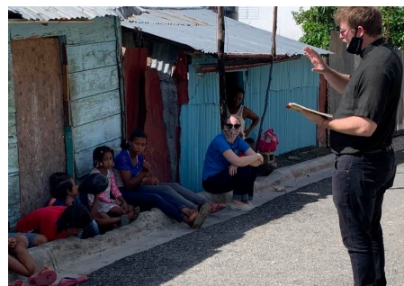
Outdoor Sunday School at new mission site in Ocoa where 6 baptisms will take place next week!