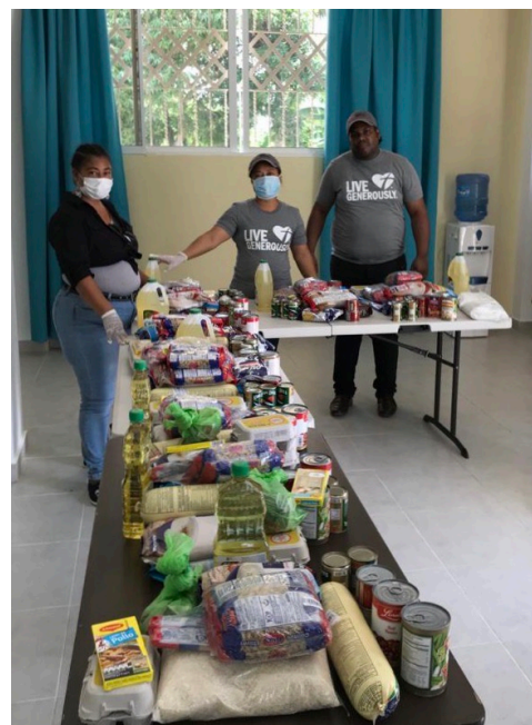
Members of Lamb of God Lutheran Mission in Licey, DR, preparing food supplies for families experiencing hardship during the pandemic.